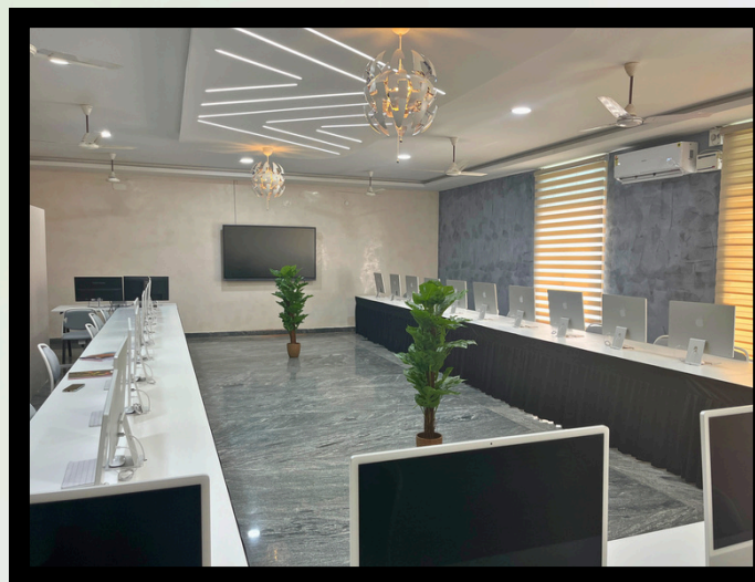
Apple Research and Innovation Lab